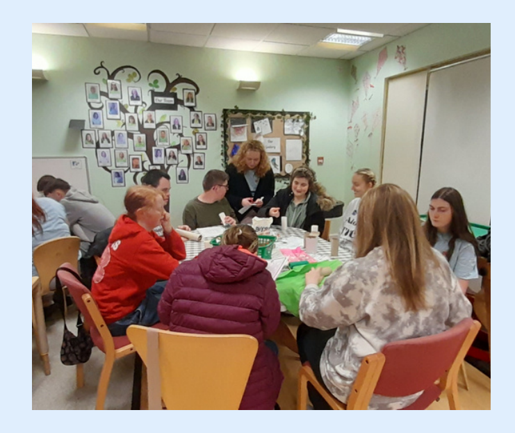
We have had various fun activities taking place in the Post 16 Thursday night Club: