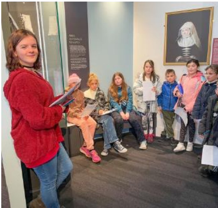
New Visuality 'art campers' during a drawing trip to Bar Covent for our Christmas 2022 HAF session