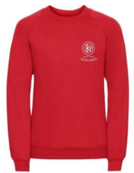
Headlands Sweatshirt £10.95