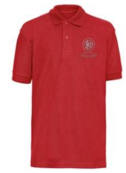
Headlands Polo Red £7.85