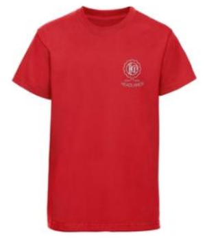
Headlands P.E. T-Shirt with L... £6.50

Uniform items are available with the school logo from