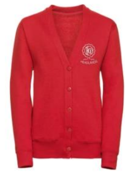
Headlands Cardigan £12.50