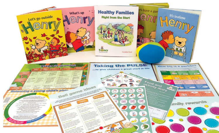
The HENRY Parent Toolkit – free to everyone joining a HENRY programme

The HENRY toolkit will help you give your child a great start in life, get the whole family involved, and keep track of how well you're doing.