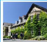
VENUES ACROSS YORK