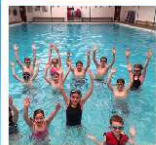
SWIM AS PART OF OUR ENERGY PROGRAMME