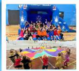
2 CHOICES EVERY HOUR