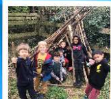
50+ ACTIVITIES EVERY WEEK

ARTY | CRAFTY | SPORTY | ADVENTURE | FUN