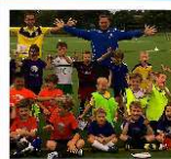
DEDICATED FOOTBALL CAMP AT MANOR